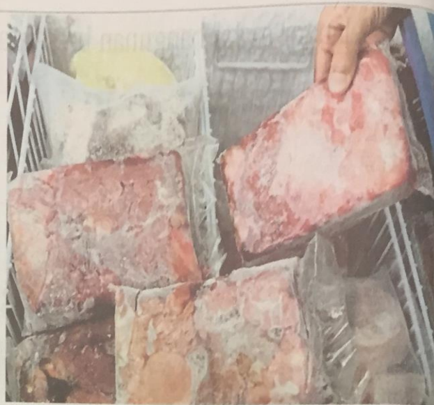
Status daging sejuk beku import terus jadi perhatian pihak berkuasa.