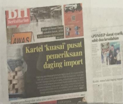
Keratan akhbar BH 21 Disember lalu.

Dilaporkan 27 saksi sudah dipanggil dalam siasatan kes berkenaan terdiri daripada pekerja syarikat, ejen pengimport serta pegawai kerajaan.